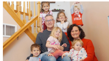
Immaculate Conception Legacy Society